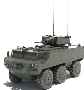
PARS SCOUT 6x6 Command Vehicle

PARS SCOUT 6x6 Vehicle, which has a high locality rate, has domestic gearboxes designed and developed by FNSS with its own resources. Also, many sub-systems in the vehicle, especially the suspension system, are developed with domestic and national resources. PARS SCOUT 6x6 is otherness with the both personnel carrying and satisfy the expectation of modern armoured vehicle.