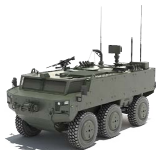
PARS SCOUT 6x6 Radar Vehicle